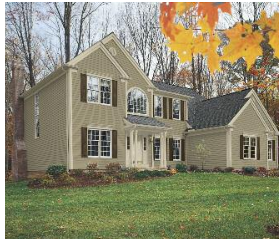
Subtle contrast. Tuscan Clay siding, Monterey Sand trim and door, Brown shutters.