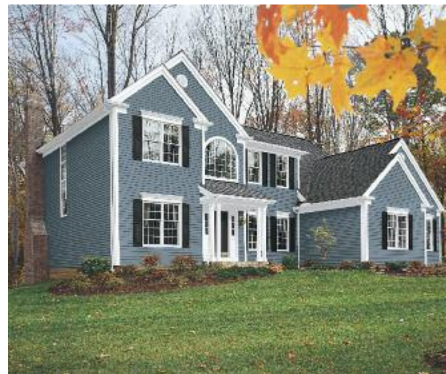
Dramatic contrast. Harbor Blue siding, Glacier White trim, Black shutters and door.

Happy with your home's exterior? Or maybe you want a new look, with different colors, more details, greater contrast.