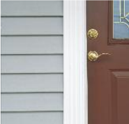
5" Trimworks fluted lineals complement this beautiful decorative door (below).