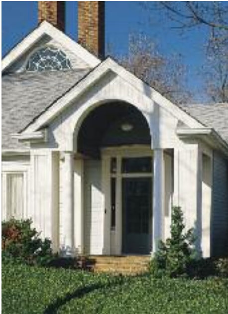
Contrast provides another way to call attention to key architectural elements. An artful contrast of vertical and horizontal siding creates an almost cathedral-like impression at the home's main entry way (above).