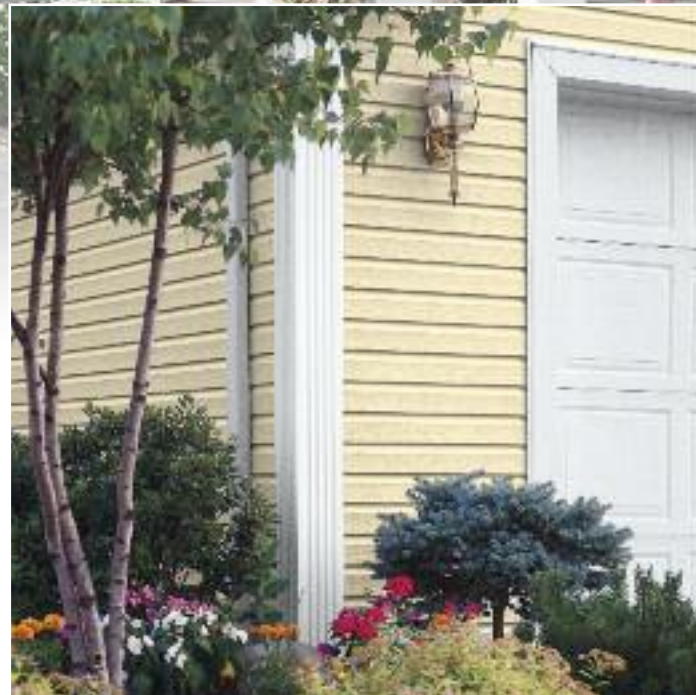
Trimworks® 7" fluted corner post.