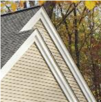
5" Trimworks lineals used as "rake" boards.